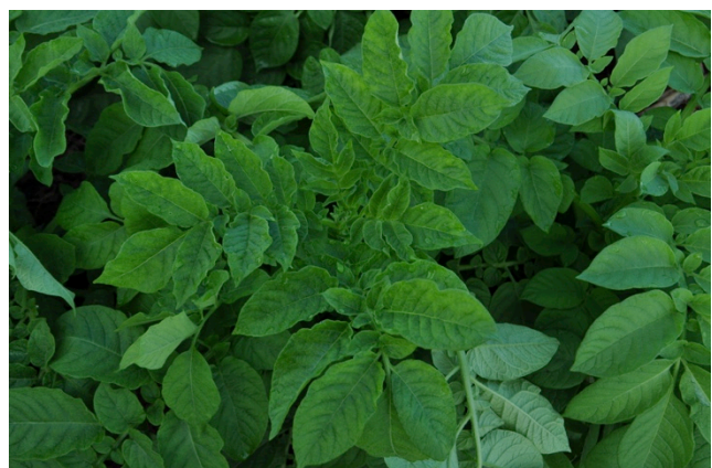
Ranger Russet infected with PVY strain NO. Subtle mosaic pattern is apparent in leaf tissue.