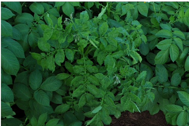
Alturas infected with PVY strain NO. Depending on cultivar and strain, PVY can be very difficult to detect.