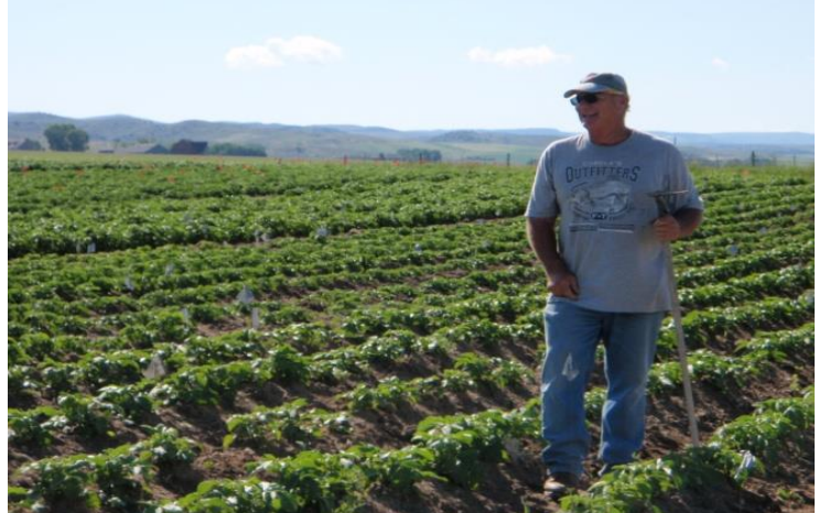
Hilling Potatoes with a Hoe

Harvest - You should be able to harvest "new potatoes" after ~60-70 days. Dig around the edges