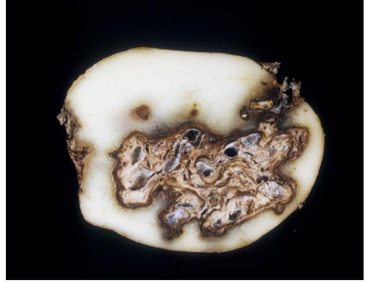
Potato Scab symptoms appear as raised or sunken corky lesions and cracks on the surface of the potato

Fusarium Dry Rot symptoms typically originate at a wound in the skin of the potato.