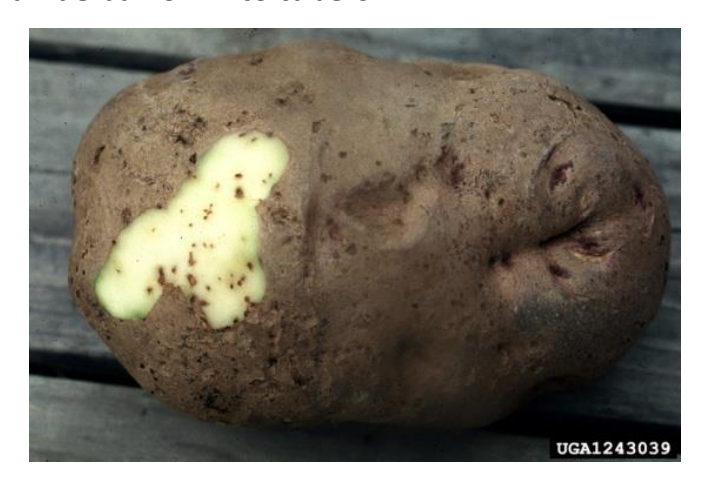
All Insect Photos - W. Cranshaw, CSU, Bugwood.org

Tri-fold with potato culture and disease information available by request Questions? MSU Potato Lab 406-994-3150