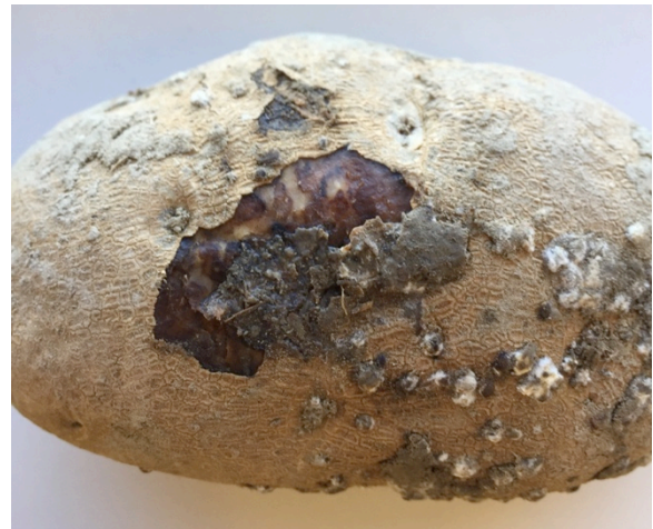
Potato tuber with late blight symptoms present.

Tuber infection is characterized by brown, dry, and granular regions that begin superficially, but can then extend deeper into the tuber tissue. Upon peeling back tuber epidermis, reddish brown to dark brown, granular tissue is apparent. Infection often appears to be quite dry.