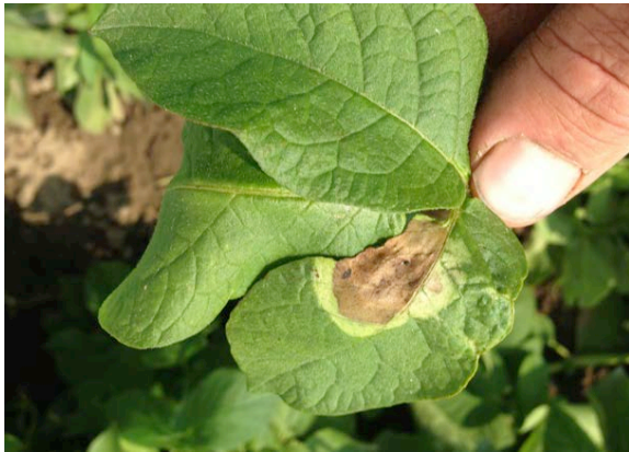
Early infection appears as a short pencil mark that rapidly expands into a grey-black lesion. During dry periods lesions can appear brown with yellow halos.

Late blight is a disease of great concern. The organism responsible for late blight, Phytophthora infestans , is known as the “plant destroyer.” Late blight has the potential to be found anywhere potato is grown. All parts of the potato plant are susceptible to late blight. The disease often appears following periods of very wet weather.