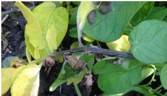
Dark brown to black lesions on leaves stems.

On very young leaves, irregular, water-soaked lesions appear. Lesions are dark brown to black, and can appear small at first. A yellow halo often appears around the lesion. Left untreated, lesions enlarge into circular necrotic patches.